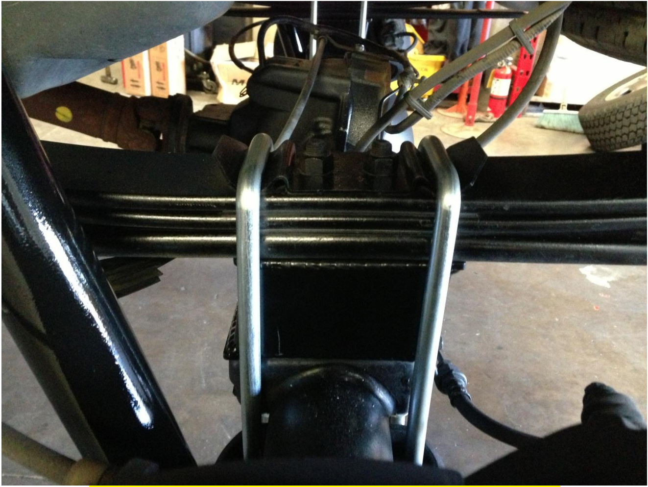
Install Rear Lift Block As Show In Picture Above