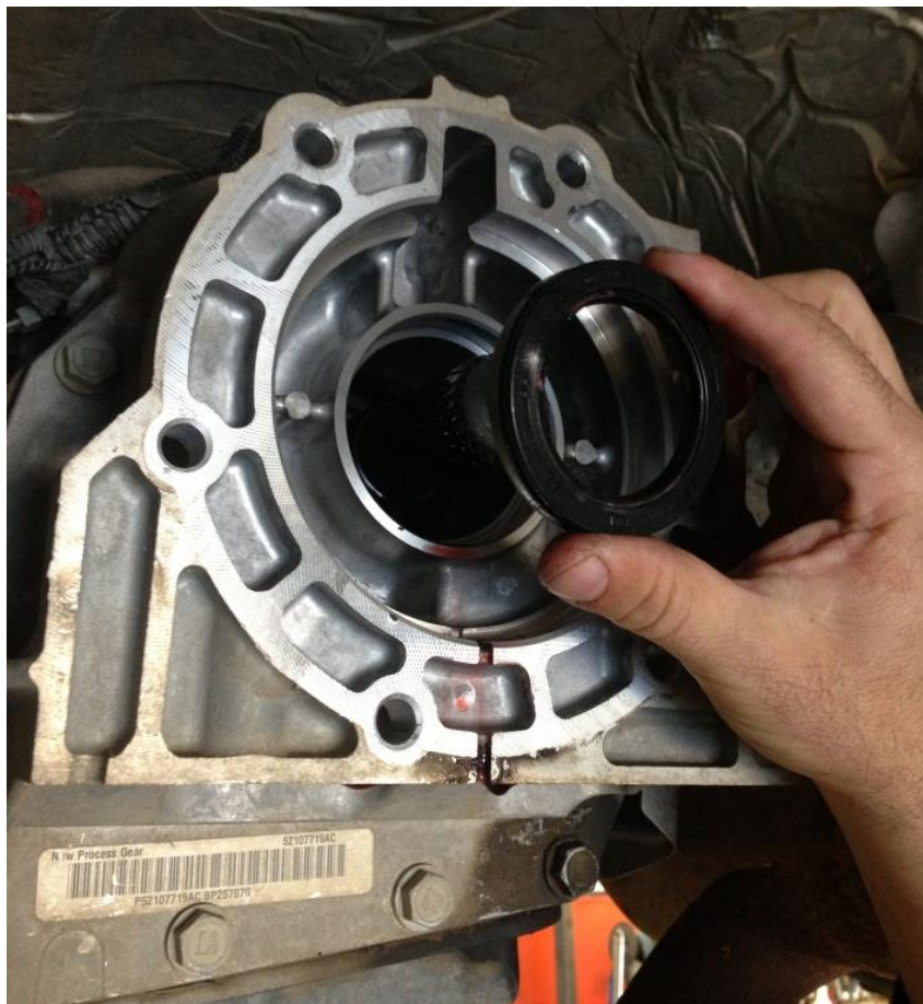
REMOVE STOCK SEAL